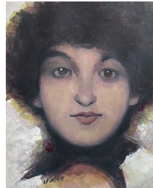
"Girl" by Charles Wallis

By Charles Wallis, at The Arts Council Gallery from September 19, 2022 to October 9, 2022.